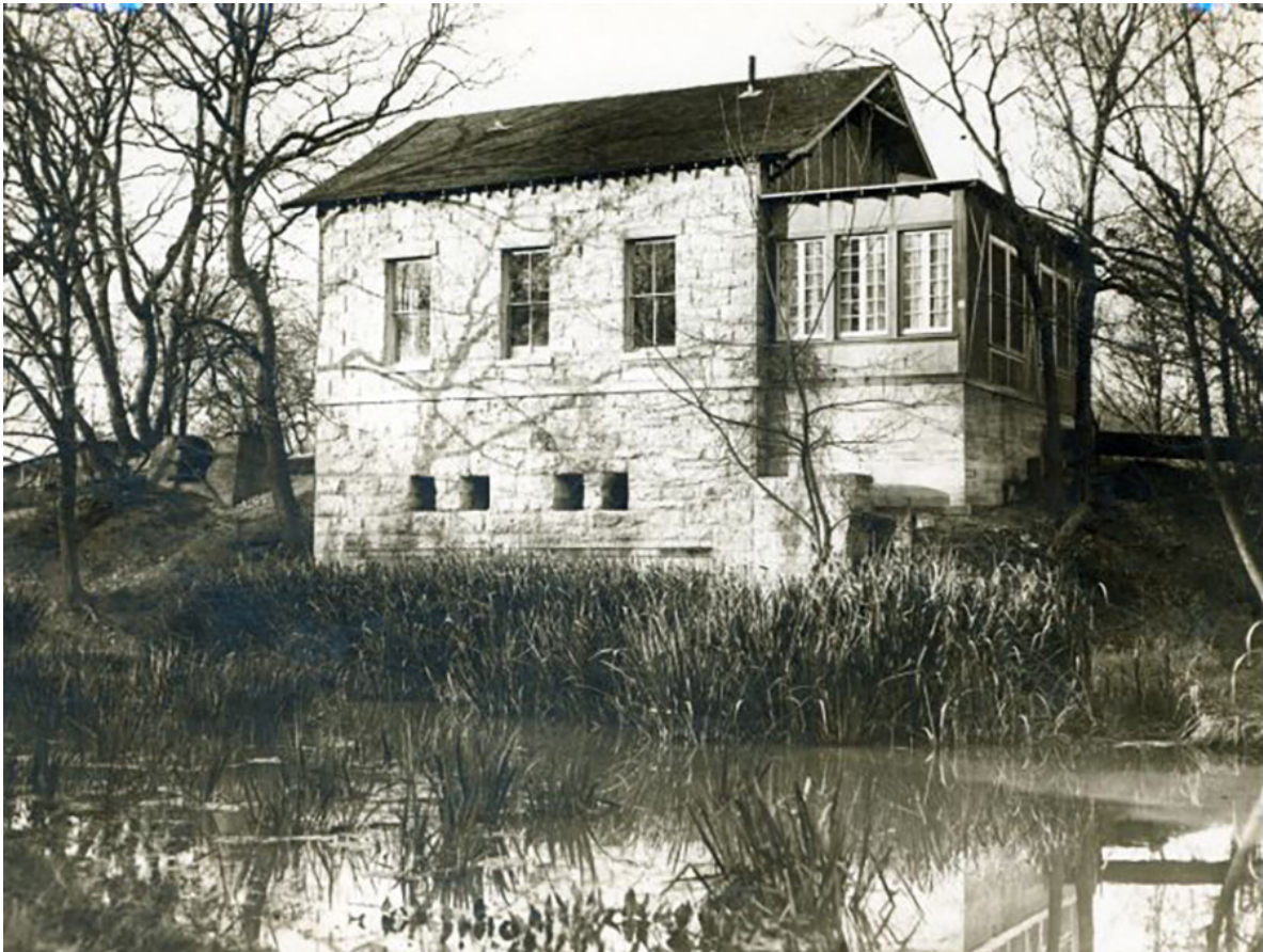
Pump House No. 2

The pump house operated on gravity and velocity to activate the pumping operations and to force water to the reservoir that was located near where the San Antonio Botanical Garden stands today. Gravity flow delivered the water through an extensive network of pipes that branched out into the City.